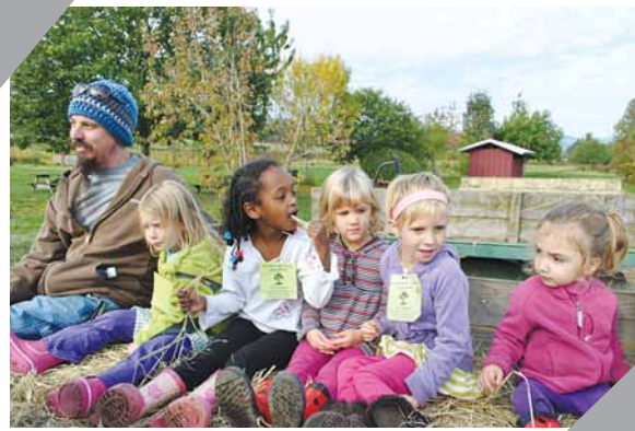
It was a cozy, bumpy ride, amidst many squeals of delight.