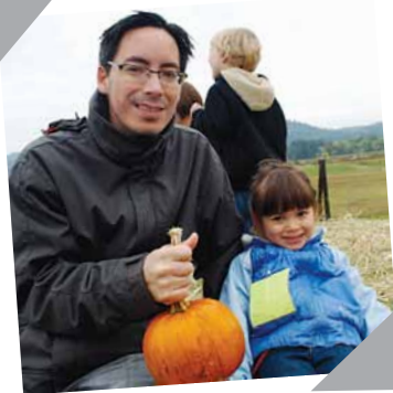
As each child picked out a pumpkin, many were surprised, but not deterred, by the spines on the stems.