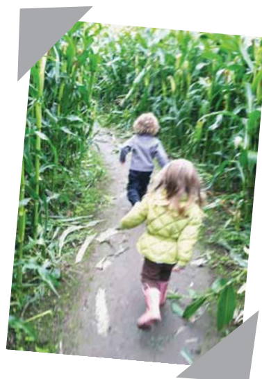
Then it was back to the corn maze, where everyone ran, skipped, and jumped their way to the lookout tower at the center and back again.